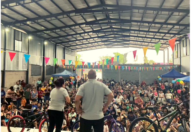
Huge crowd at the kids' event & our new Kaleo Reynosa auditorium