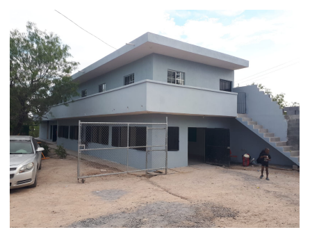
The 2nd floor at the refugee shelter in Reynosa

Refugee Center Anniversary: This month we celebrated our first anniversary of opening the Refugee Center. The Lord has done great things! Around 3,000 people have been housed there in the first year. Each of them having a chance to hear the gospel and attend prayer meetings and services. The Lord has given us great favor with local officials and with other non-profit organizations as we provide a safe place for families seeking asylum in the US.