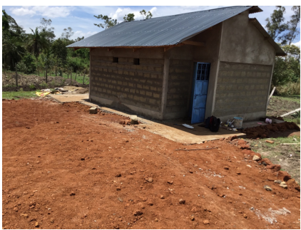
Restrooms and showers for the Bible college in Kenya