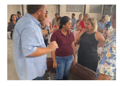
One of the baptisms on Sunday morning