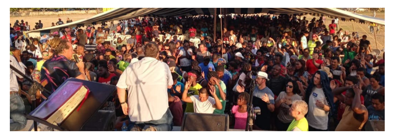
Altar call at the crusade! Hundreds of locals and refugees surrendering their lives to Jesus!