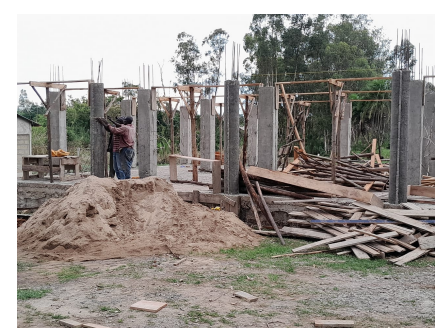
Construction in Kenya of the mission school housing. Above this will be women's dorms.

If the Lord leads you, please consider sowing into this vision!