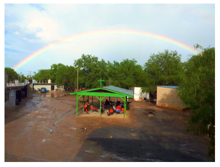
A rainbow that appeared at the Refugee Center, reminding us of God's promises!