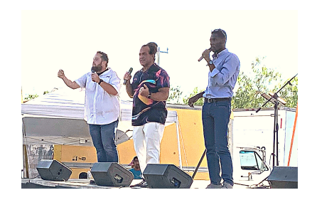
Preaching in English, Spanish & Creole