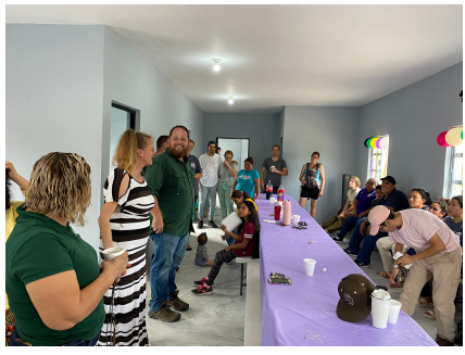
Dedicating the new office space and apartments!